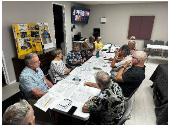
2023 Recent Open Leadership meeting.