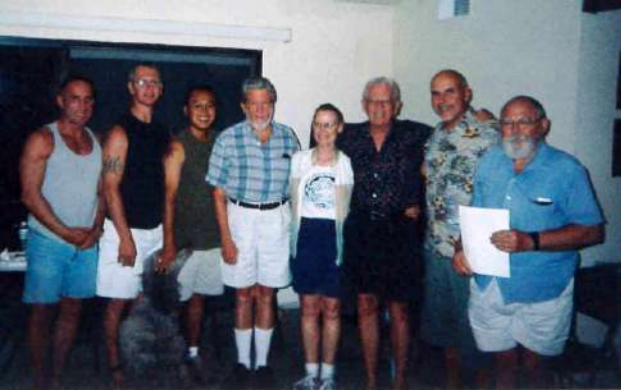
2004 Earliest photo of an Open Leadership meeting.