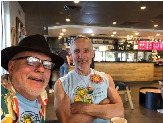
2022 Pre-Pride parade coffee.