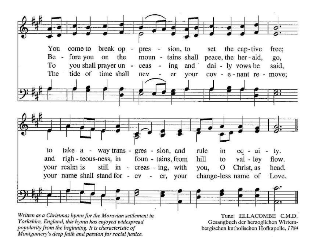
In Faith We Open Our Hearts to Ministry